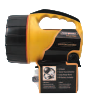
Industrial 6V Krypton Lantern

6V battery included, krypton bulb with spare bulb holder, long range beam, 45° hands free swivel stand, push-button switch, water resistant and floating, lifetime warranty.