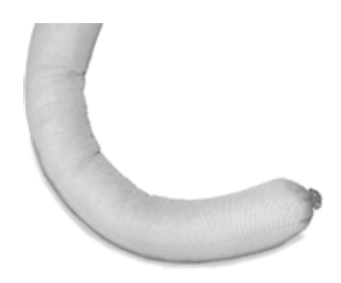
Sorbent Socks 7.6cm x 2.4m (3"x 8'), 15/box.

UNIVERSAL SKU: 9300.179.001 OIL ONLY SKU: 9300.103.001 HAZMAT SKU: 9300.141.001