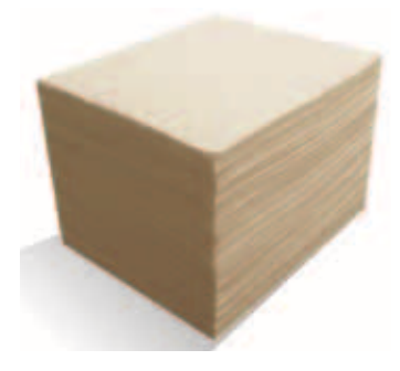
Sorbent Pads Heavy weight, metblown, 100/bale.

UNIVERSAL SKU: 9300.179.001 OIL ONLY SKU: 9300.103.001 HAZMAT SKU: 9300.141.001